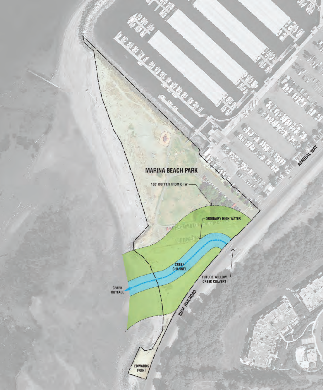
Stream Alignment Option A