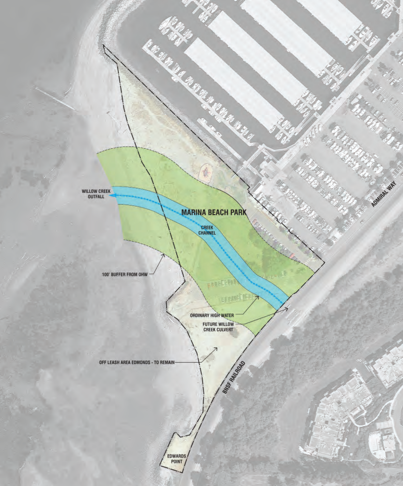
Stream Alignment Option B