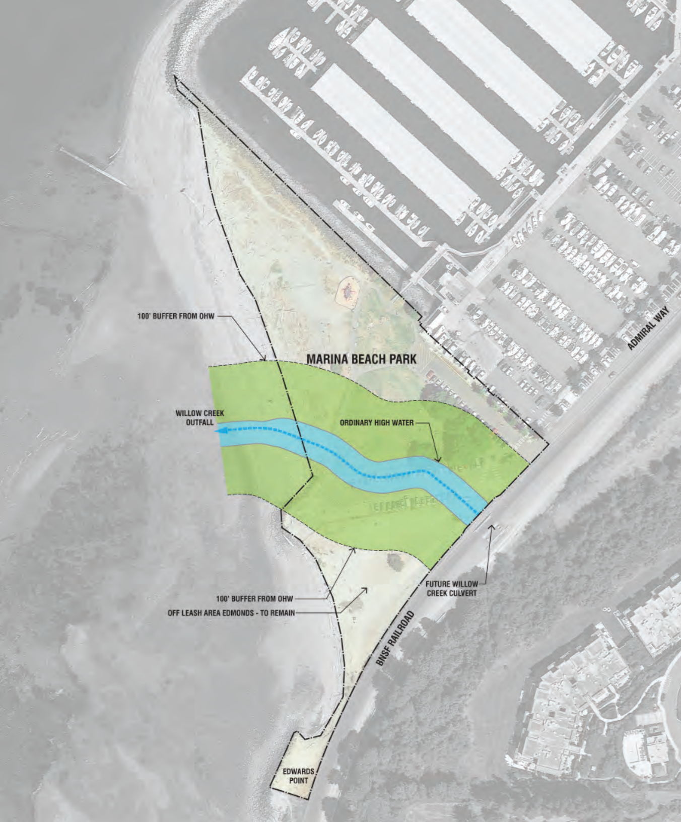
Stream Alignment Option C